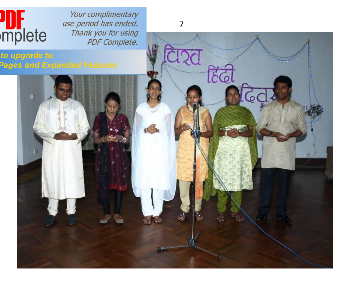
25<sup>th</sup> January – 1<sup>st</sup> February 2011