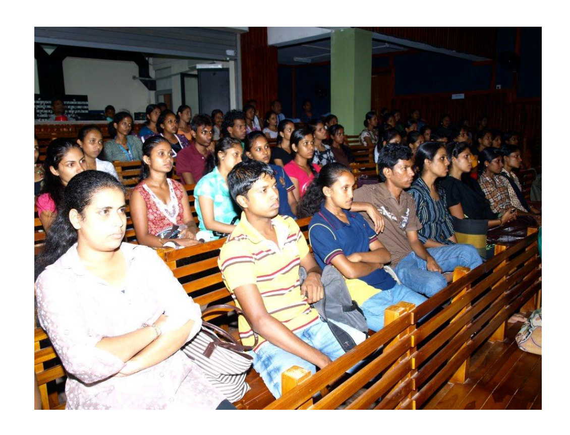
Photographic Exhibition "Islamic Monuments of India" 8-13 February 2012 at J.D.A Perera Gallery, Colombo 7