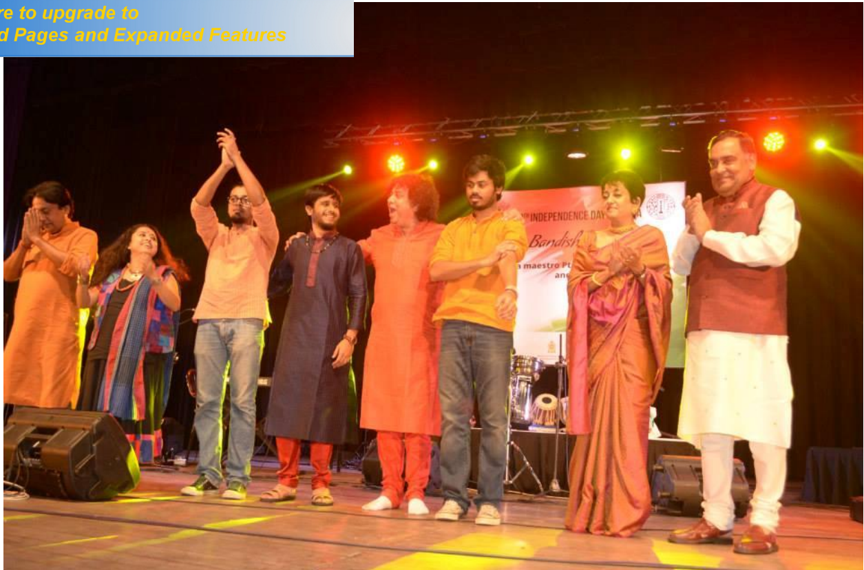
Performance on 15 th August 2015 at India House

Click Here to upgrade to Unlimited Pages and Expanded Features