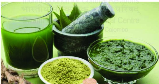
Azadirachta indica or neem leaves have unbelievable and numerous health benefits. It can be enjoyed as a juice, a spicy chutney with chillies or as a roughly ground powder

Punjabi cuisine is hugely popular for the intoxicating aromas of spices