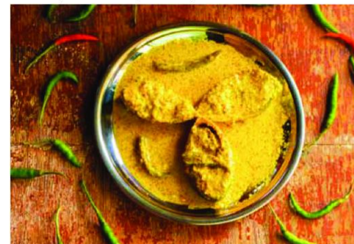
A traditional fish curry in mustard sauce. Mustard seeds are rich in a nutrient called selenium, known for its high anti-inflammatory effects

ingestion of food within four to five hours of cooking is the best. It's interesting that even today, the ancient concept of a balanced Sattvik meal, cooked fresh with a bouquet of spices, is considered one of the healthiest in the world.