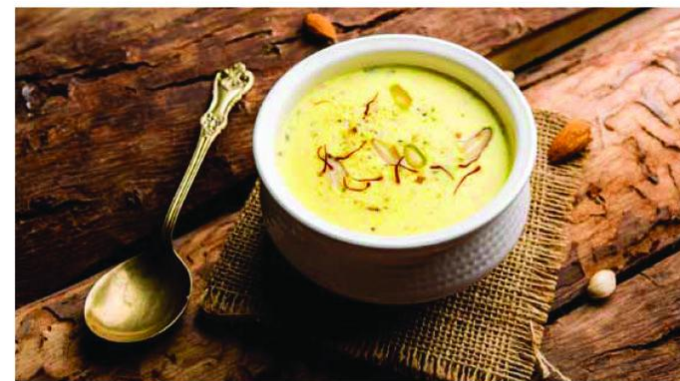
A bowl of rabri, a dessert, enjoyed all across the country, is often garnished with strands of saffron.