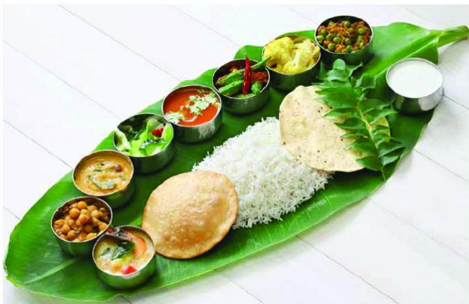
Traditional South Indian meals, served on banana leaves are known to be rich in spices that prevent several ailments. Most Indian kitchens apply the concept of minimal wastage along with many eco- friendly practices

Cumin and bishop's weed, the culinary equivalents of modern indigestion drugs, help digestion and check food-borne disorders. Pepper improves absorption of essential nutrients and promotes gut health. A pepper drink is often the go-to cure in many Indian homes to fight a flu.