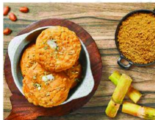
Jaggery is a staple in traditional Indian kitchens. It is rich in anti-oxidants, aids digestion and is known to cleanse the liver

For instance, turmeric - the commonest of all Indian spices - is added in almost all dishes. It not only lends the dish a golden hue but is known for its antiseptic properties and in reducing existing metabolic syndromes. We have often had our mothers urge us to drink warm milk mixed with turmeric to treat dry cough, sore throat and purify the blood of toxins, thereby upping the