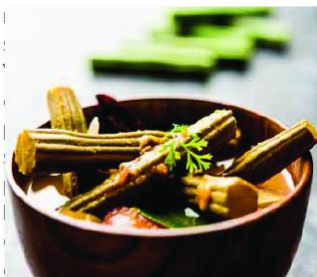
Drumsticks in a bowl of sambhar for added health benefits

Khichdi is often the remedy to dietary distress and is used to