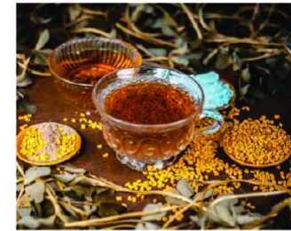
A tea made from fenugreek leaves is known to provide relief from anemia, loss of taste, fever and even dandruff,

chutney is prepared in Maharashtra during the festival of Gudi Padwa. Neem has proven remedy to cure loss of appetite, fever and also boost cardiac strength. Curry leaves, the staple garnish in Indian cooking across states, is a popular natural anti-oxidant. "Almost all parts of a Azadirachta indica or neem tree have beneficial properties - the leaves had raw or cooked, purify