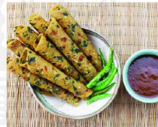
A thepla (flatbread) made with fenugreek leaves, known to absorb sugar and reduce bad cholesterol

a distinct flavour and also to make them healthier. For example, moringa leaves and fruits (drumsticks) are used in curries across north India to help fight bacterial afflictions. Neem too is used in meals and brewed into a thick concoction called kadha . A special neem leaves