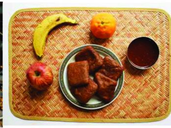
A Sattvik meal of cottage cheese fritters deep-fried with a layer of buckwheat flour (kuttu ka aata)

blood and aid digestion; the bark extract has been found to cure stomach and intestinal ulcers and neem oil reduces skin blemishes. The oil is also a cure to breathing problems," says nutritionist Kavita Devgan.