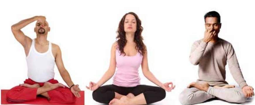
Different postures of Pranayam

mind and helps to establish control over the mind. In the initial stages, this is done by developing awareness of the 'flow of in-breath and out-breath' (svasa-prasvasa) through nostrils, mouth and other body openings, its internal and external pathways and destinations. Later, this phenomenon is modified, through regulated, controlled and monitored inhalation (svasa) leading to the awareness of the body space/s getting filled (puraka), the space/s remaining in a filled state (kumbhaka) and it's getting emptied (rechaka) during regulated, controlled and monitored exhalation (prasvasa).