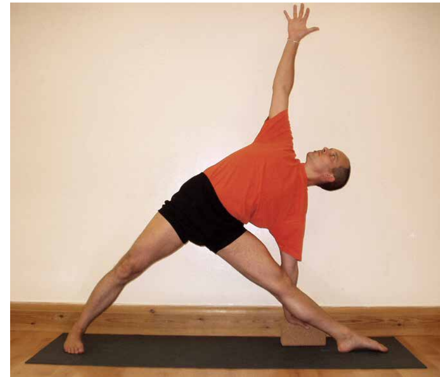
B.K.S. Iyengar was the founder of the style of yoga known as "Iyengar Yoga" and was considered one of the foremost yoga teachers in the world

Acharyatrayas-Adi Shankracharya, Ramanujacharya, Madhavacharya- were prominent during this period. The teachings of Suradasa, Tulasidasa, Purandardasa, Mirabai were the great contributors during this period. The Natha Yogis of Hathayoga Tradition like Matsyendaranatha, Gorkshanatha, Cauranginatha, Swatmaram Suri, Gheranda, Shrinivasa Bhatt are some of the great personalities who popularized the Hatha Yoga practices during this period.