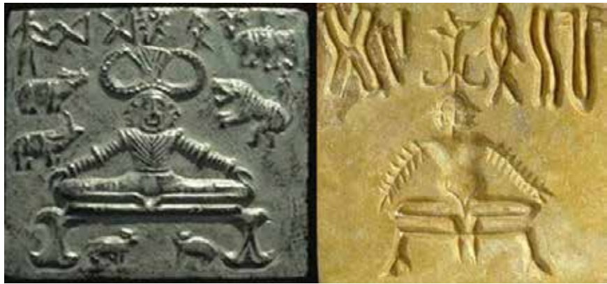
A number of seals and fossil remains of Indus Saraswati valley civilization with Yotic motives and figures performing yoga indicate the presence of Yoga in India.

Several Thousand years ago, on the banks of the lake Kantisarovar in the Himalayas, Adiyogi poured his profound knowledge into the