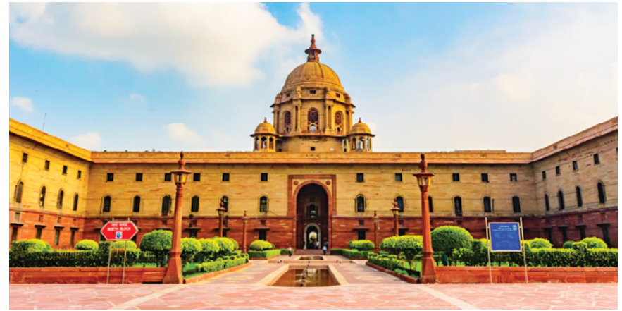
Central Secretariat is where the Cabinet Secretariat is housed, which administers the Government of India on Raisina Hill in New Delhi

Sinha was the first president of the Constituent Assembly. Later, Dr. Rajendra Prasad was elected its president. Dr. B.R. Ambedkar, the chairman of its Drafting Committee, is considered the chief architect of the Indian Constitution which provides a comprehensive and dynamic framework to guide and govern the country, keeping in view her unique social, cultural and religious diversity. It establishes the main organs - executive, legislature and judiciary, defining their powers, demarcating their responsibilities and regulating the inter se relationship. It inter alia lays down the basic structure of governance and the relationship between the government and