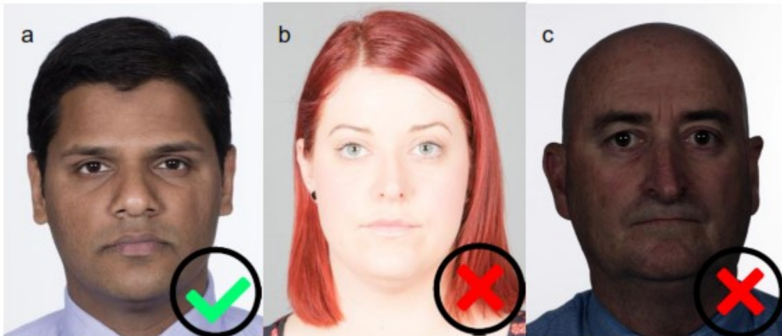
a) Compliant portrait, b) Over exposure, c) Under exposure.