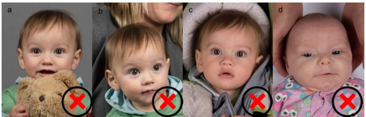
a) Toy, b) supporting person, c) Non-neutral background, d) Supporting hands.